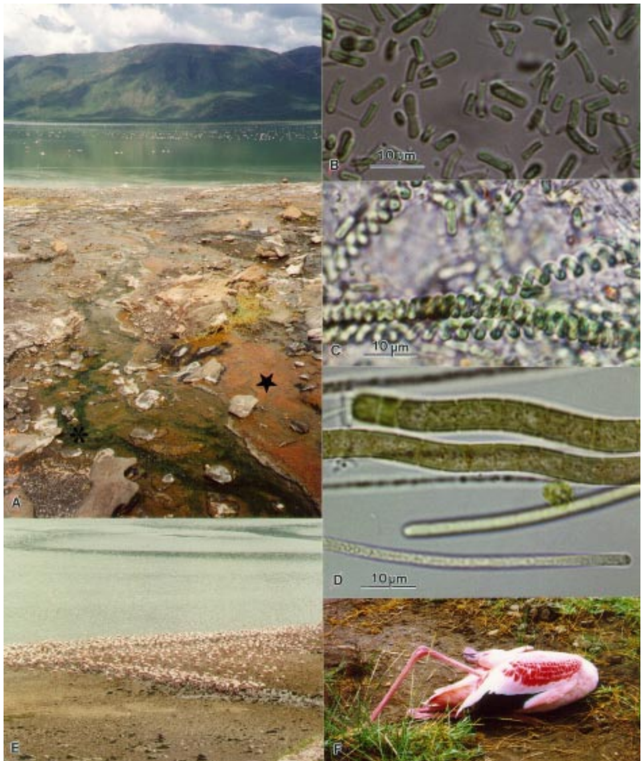
Fig. 1A: Sampling sites of hot spring cyanobacteria at Lake Bogoria. The star indicates the sampling site of sample HK1, dominated by P. terebriformis and O. willei ; the asterisk indicates the sampling site of sample HK2, dominated by S. subsalsa and S. bigranulatus . B-D: Dominant cyanobacteria in hot springs at L. Bogoria. B: S. bigranulatus . C: S. subsalsa accompanied by S. bigranulatus . D: P. terebriformis (above) and O. willei (below). E: Groups of Lesser Flamingo drinking water from the hot springs flowing into the lake. F: Dead Lesser Flamingo with convulsed position of extremities and neck (opisthotonus).