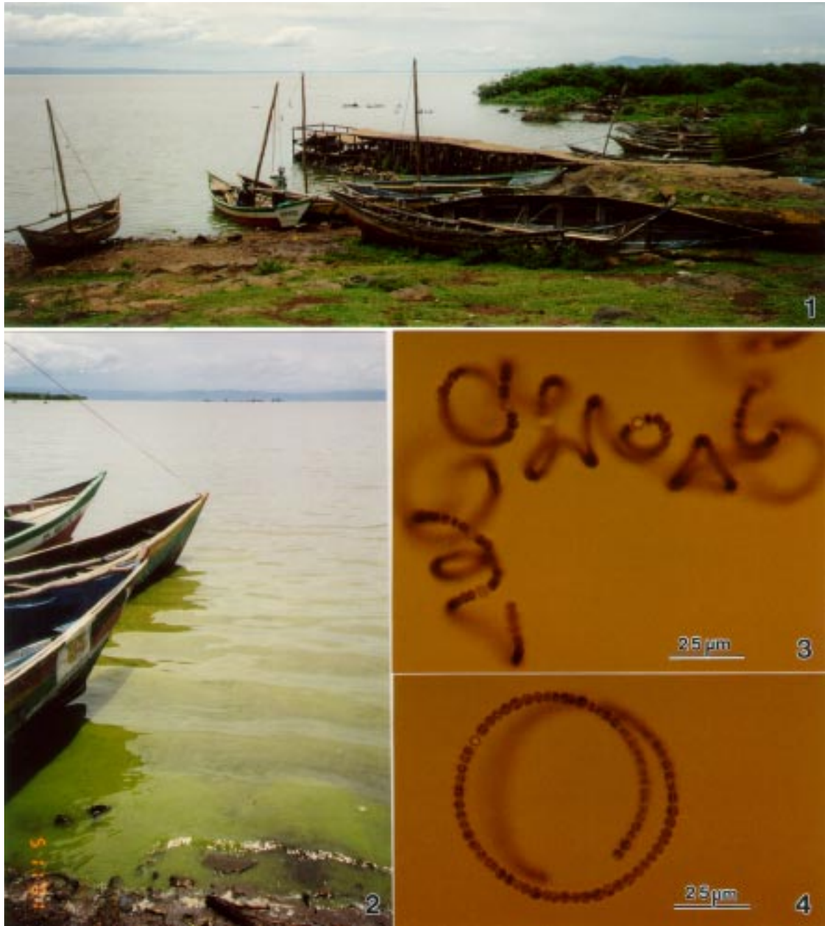
Fig. 1. Sampling site: Jetty of the fisherman's village Dunga, near Kisumu, Kenya.