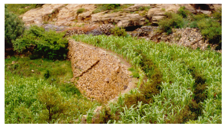
Photograph 4.4 House wall type of terrace (August 1997). The terrace wall is vertical and includes stairs to connect the upper and lower terrace. On both fields sorghum was grown, on the upper one with qat intercropping.

The second type has a stable "house wall" type wall which is exactly vertical. It is built of properly shaped natural stones without cement. Those "expensive" terrace walls are only used if the terraces have a large surface for agricultural use (see photograph 4.4).