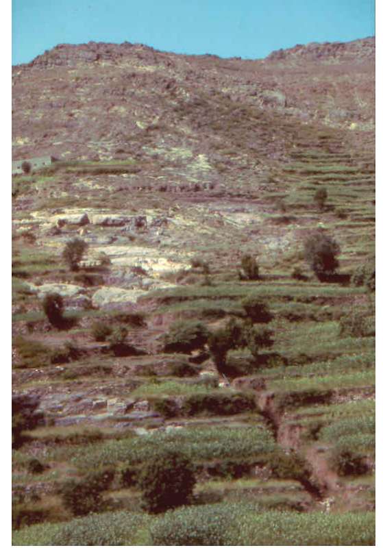
Photograph 4.2 The terraces in the lower part of the photo are cut by a channel which collects the water from the up-slope area above.

This traditional system was changed in the late sixties/early seventies of the last century in several steps.<sup>39</sup> New channels were cut from the uphill runoff areas through the terraces down to the wadi (see photograph 4.2). They cause bypasses and cut off a significant amount of the terraces from water harvesting. Only the adjacent terraces are still irrigated from the channel. The main object of the change was