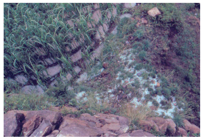
Photograph 4.5 Special hoeing patterns in the sorghum field (upper left) create shallow ponds which increase the retiontion significantly.

The leaf picking reduces the leaf area and consequently the transpiration significantly. The leaves are also used as fodder. This is a second form of "fodder harvest" and may cause the ear development to be impeded and delayed. Leaf picking is done only once or twice times during the crop development or mid-season stage. Both measures are also done in case of plant deseases.<sup>43</sup>