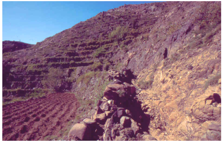
Photograph 4.1 Semi-pervious channels (in the center of the photo) protect the terraces (on the left) from destructive floods which come from the water harvesting areas (on the right). On the terraces, the plowing creates a corrugated pattern to increase retention.

The catchment is geologically divided in two sections. The lower basis consists of Tawilah sandstone which occurs in both facies. the reddish Tawilah-sandstone (Kt)below and the brighter Medj-Zir-sandstone (Tm) on top. The sandstone submerges