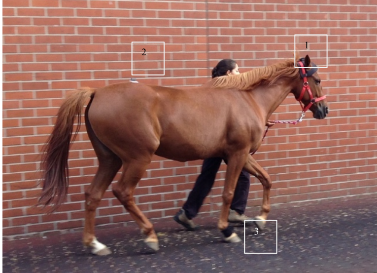
Figure 1: A horse instrumented with the 3 inertial sensors consisting of 1) accelerometer at the poll, 2) accelerometer at the pelvis and 3) gyroscope at the right fore pastern.