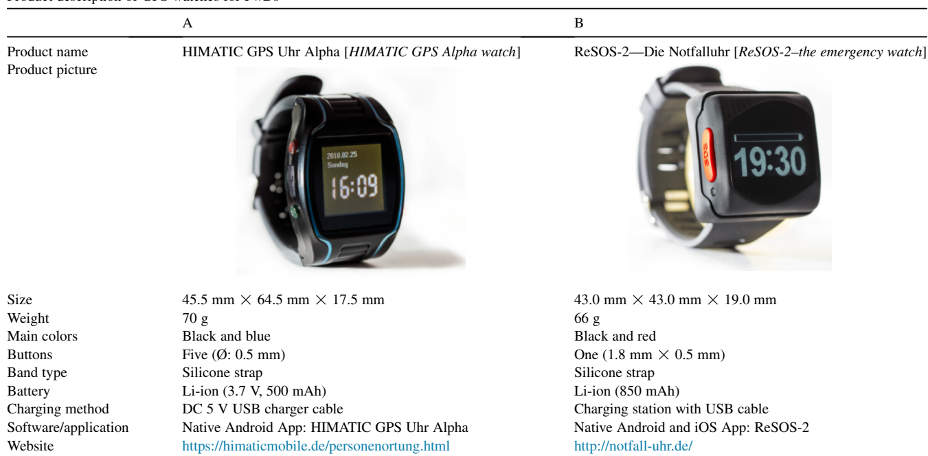
Table 1 Product description of GPS watches for PwDs

Abbreviations: A, product A; B, product B; GPS, global positioning system; PwDs, persons with dementia; USB, Universal Serial Bus.